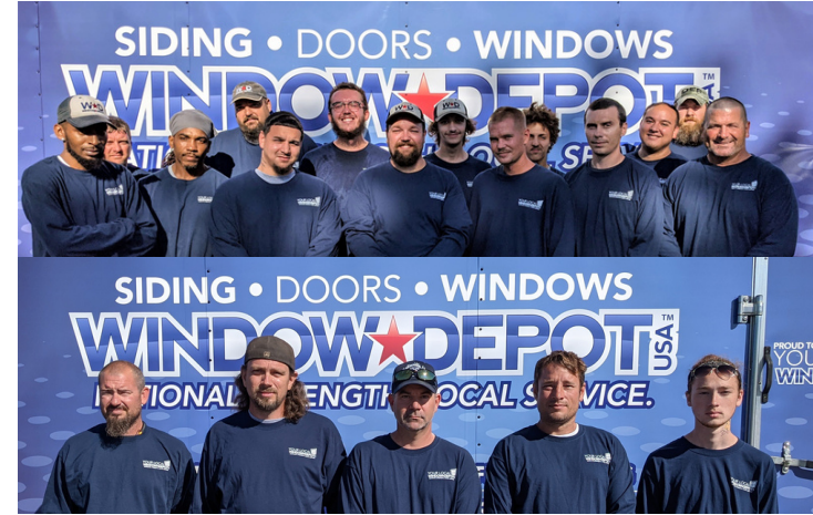
Our In-House & Certified Installation Teams